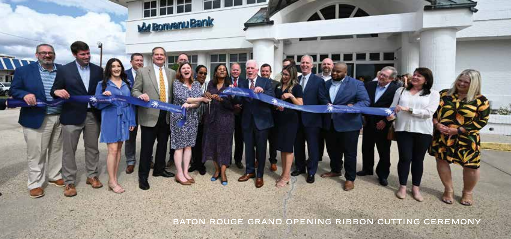
BATON ROUGE GRAND OPENING RIBBON CUTTING CEREMONY